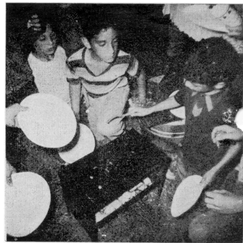
LOCUST EATERS at Boys Camping Trip

Thirty-two in all - something for which we can all be joyful, remembering that we, too, were once babes and, as many of us know, stumbling and tripping while trying to learn God's ways because of our own carnal natures. But, rejoice, my brethren, for with God's Holy Spirit we can do all things.