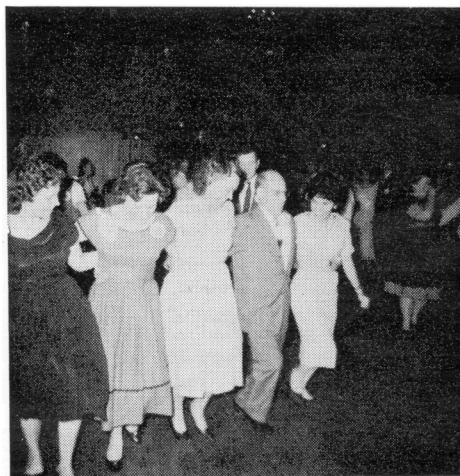
One of the recent, very successful Chicago Socials