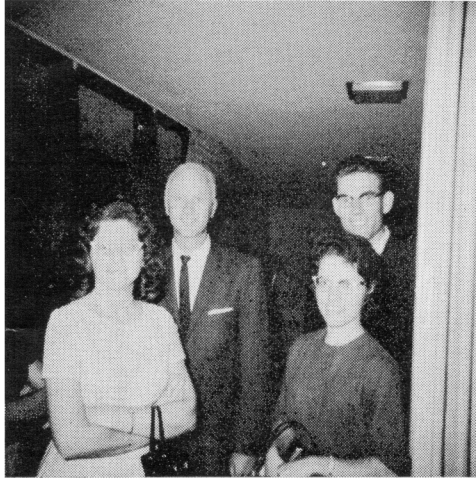
HOLIDAY INN, TYLER

Every day at the Feast brought about new things to do, different types of entertainment and interesting tours. We were entertained at each meeting with special music by either the Pasadena Chorale, New York Chorale, Chicago Chorale or Glade-water High School Chorale. Planned recreation such as roller skating, bowling and vimming was enjoyed by the younger members and by many of the adults. Many of us also indulged in fishing, boating and water skiing.