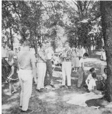
NORTH AURORA PARK

All who came spent a joyful day playing together and can look forward to another picnic next year.